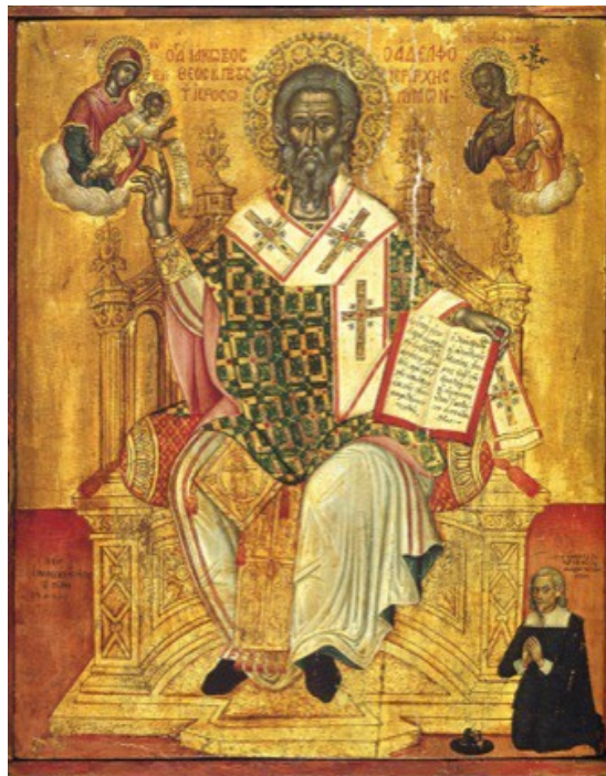
The Holy Apostle James, the Brother of the Lord, First Bishop of Jerusalem