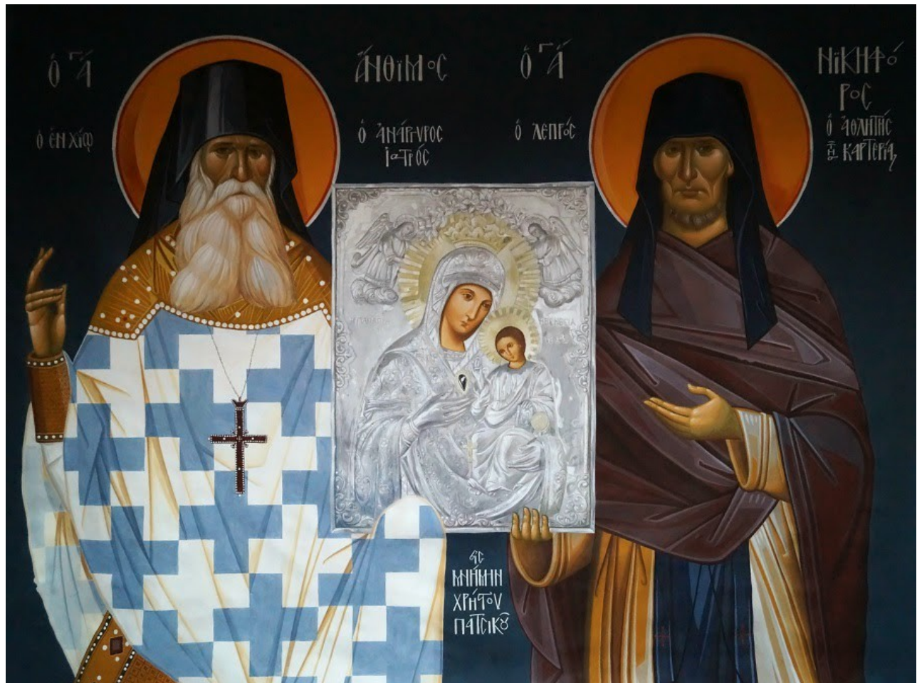
Collection of prayers made at St Innocent Orthodox Church, Tarzana CA

O venerable father Nicephorus, shunning pain and bodily corruption, like a horse thou dost gallop towards the heavens, the steadfast support of lepers. A brilliantly lit temple of God, thy body shone in its illness.